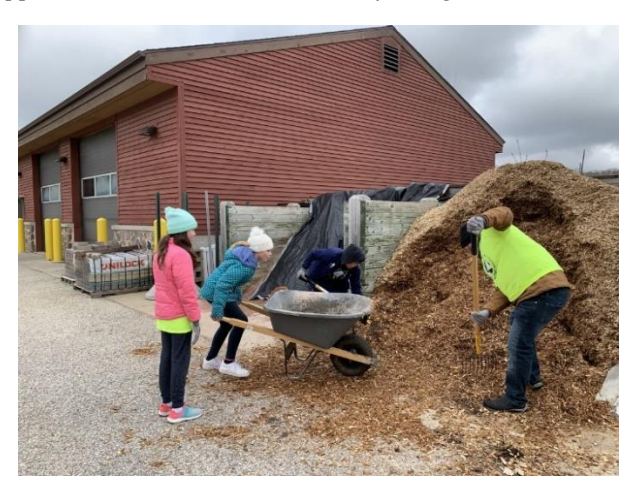
Loppers and mulch cleaned up trails for summer access.