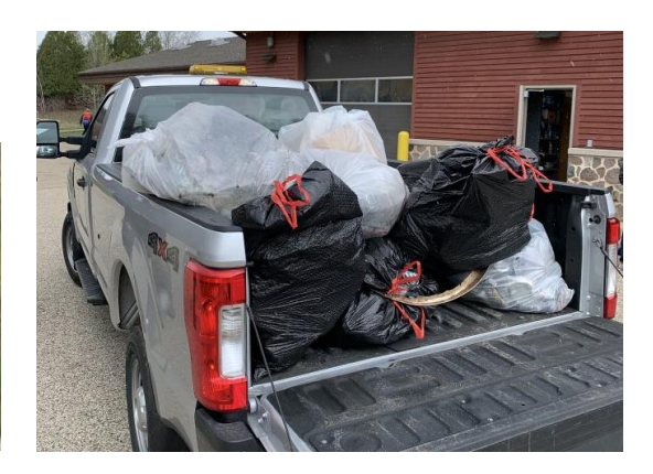
Refuse recycling and litter reduction underscored an Earth Day theme of environmental stewardship.