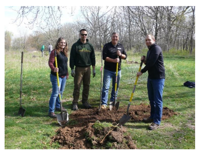
... and to the families and individuals who came to honor a valued Arbor Day tradition.