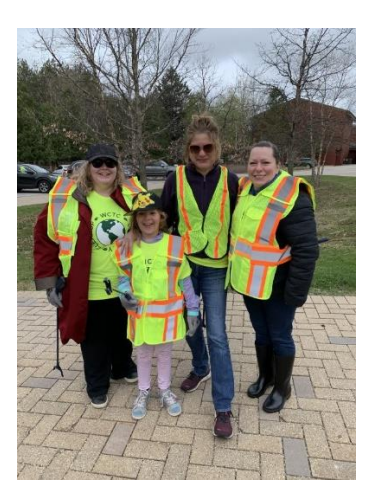
Trail maintenance and roadside litter pickup supplies awaited WCTC volunteers of all ages.