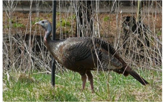
Left: a garter snake forages through creekside undergrowth Right: a wild turkey grabs a snack beneath the seed feeder