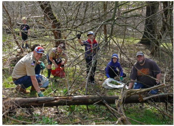
“Mission Possible” Waukesha North Eco-Warriors (left) and Rose Glen Pack 63 Scouts attacked garlic mustard stands