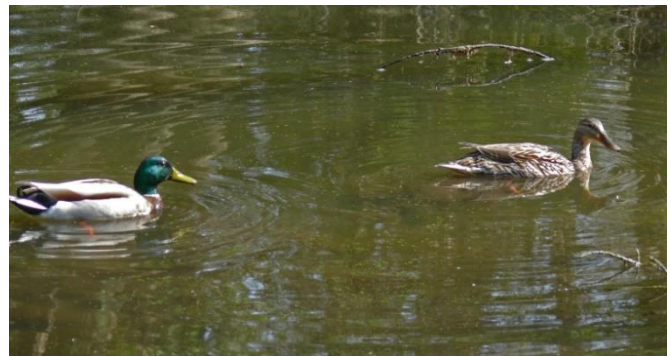
A mallard couple feed quietly in a pond adjacent to the boardwalk