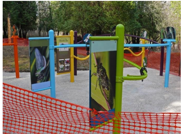
Completed Discovery Trail attractions include the Eagle Nest sitting area (hewn ash logs) and Insect Exploration Station