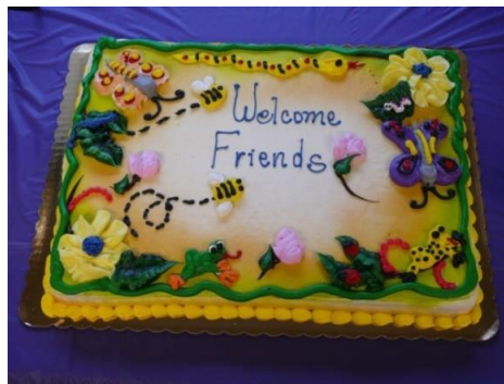
Annual meeting dessert cake... membership has its (sweet) privileges!