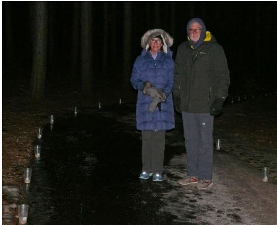
(left: a Delafield couple enjoys their candlelight hike)

■ Our Friends-sponsored Wild Winter Night was held at Fox River Park, Fox Brook Park, and Retzer Nature Center on three Thursday evenings in February. The two parks hosted evening candlelight hikes, while Retzer offered candlelight hikes plus planetarium shows on “Constellations With Tails”, presentations on “Owls of Wisconsin”, stories at the Reading Corner, an “Animal Tails” table in the Community Room, and a warm campfire outdoors. Mama D’s Coffee Shop offered hot beverages and snacks for visitors. The event at Retzer drew nearly 400 visitors on a chilly, windy night.