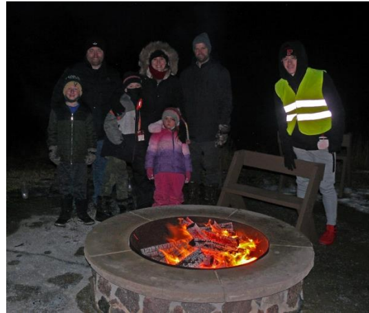
(right: a New Berlin family warms up at the campfire)