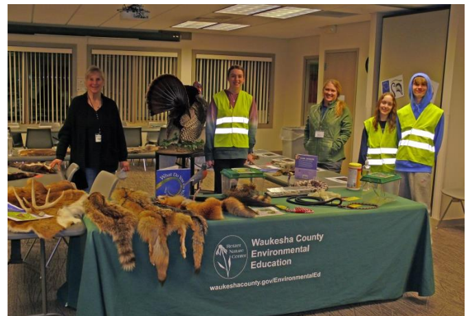
(right: Pewaukee High youth and RTNs at the Animal Tales table)