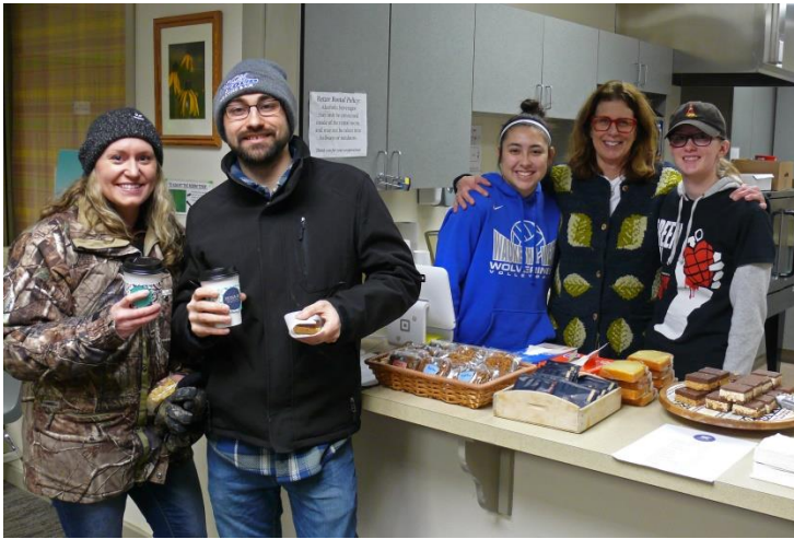
(left: Mama D's offers hot drinks and dessert items for customers