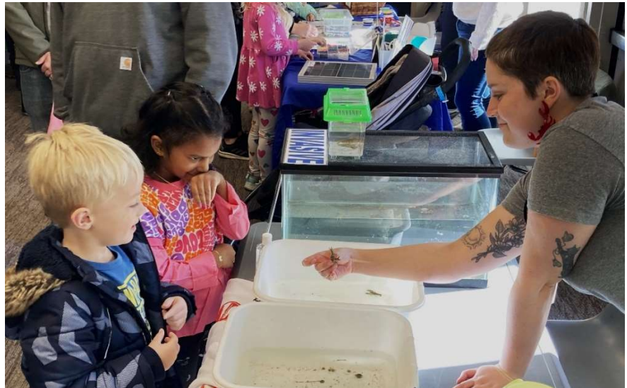
Young learners were wowed by hands-on demos of wind energy, aquatic invasives, and other interesting topics