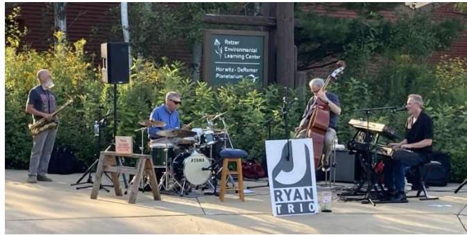
(left) Friends volunteers sold 50 th Anniversary commemorative items and conducted a 50/50 fundraising raffle (right) JRyanTrio drew an enthusiastic crowd of beer garden visitors