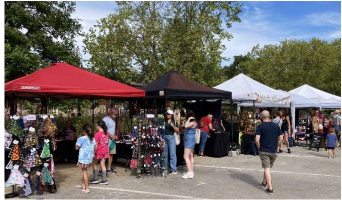
Over two dozen craft vendors greeted visitors entering the event grounds