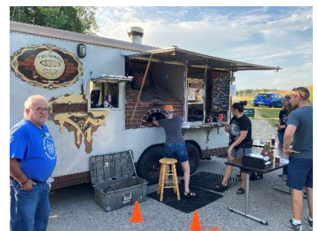
Beer garden beverages and food truck munchies drew visitors to the nature center each evening.