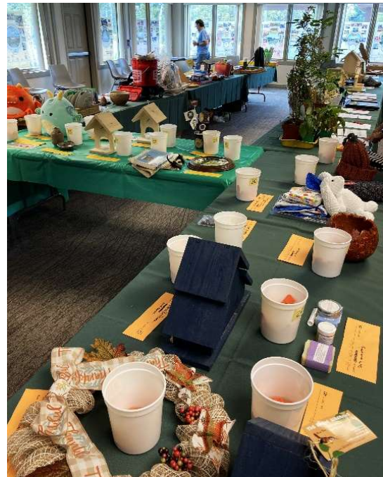
The silent auction and gift raffle raised $2600 for our proposed Outdoor Shelter project