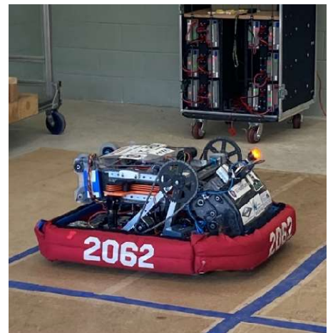
Horwitz-DeRemer Planetarium shows and local robotics team demonstrations were a unique visitor draw