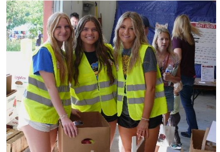
Artisan vendors lined the parking lot; the popular Apple Market featured tree-picked apples, pies and cider; volunteers included students from Mukwonago High School.