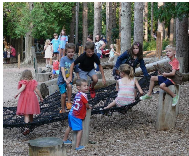
Friends of Retzer Board members manned an information table at the Discovery Trail entrance to the popular play area.