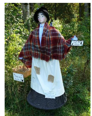
Scarecrow Lane was an annual event favorite for visitors heading out to enjoy a walk on the wild side.