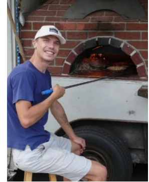
Cold beer, hot pizza, and (thankfully) mild, sunny summer weather attracted a friendly crowd on both nights.