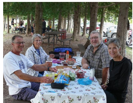
Folks enjoyed gathering and picnicking on the west lawn and in the parking area woods.