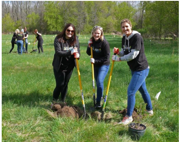
Kohls volunteers worked quickly to plant all the trees; cool, sunny weather conditions made for an ideal outing.