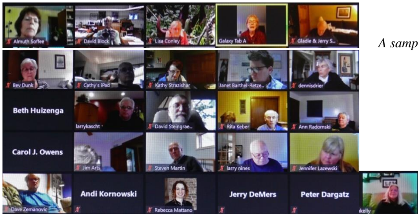
A sampling of the Zoom meeting gallery