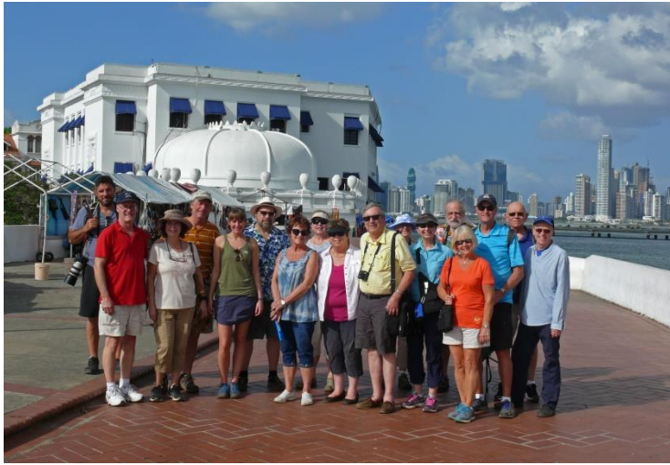
The group touring historic Panama City