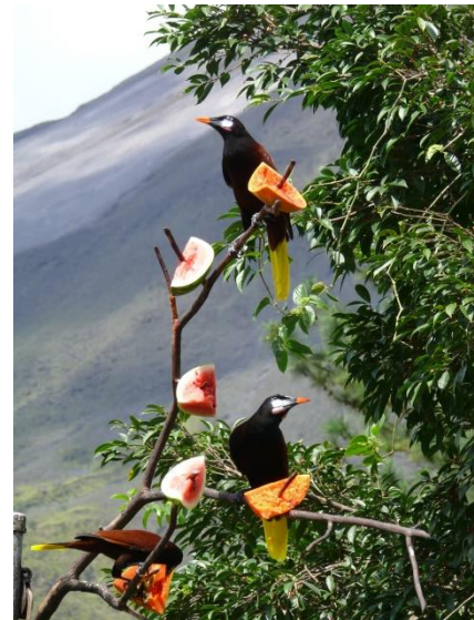
Volcano viewing and bird watching (Montezuma oropendolas) at Arenal Observatory in La Fortuna