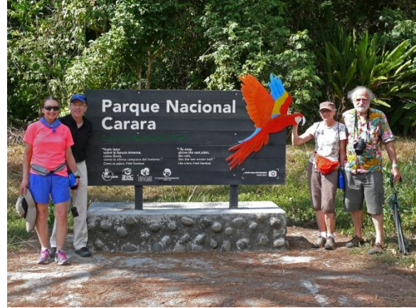
Life's a beach – posing on Costa Rica's Pacific shore near Tarcoles ...with scarlet macaws waiting to entertain us