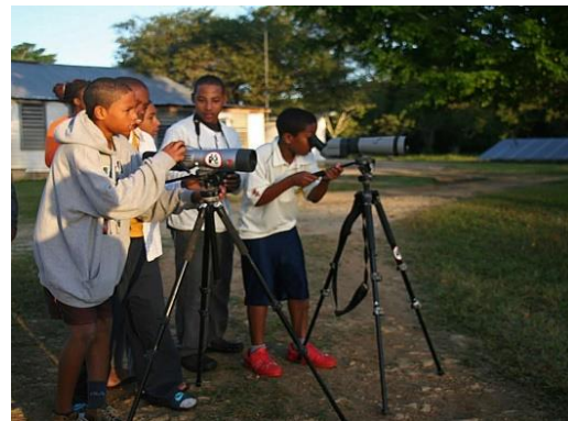
Students pose atop an abandoned logging camp tractor, and used spotting scopes to identify tropical birds.